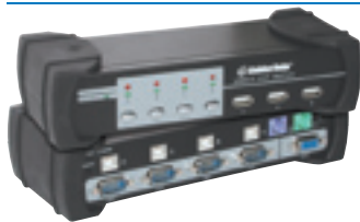
Cables To Go Trulink™ 4-Port VGA/USB 2.0 and PS/2 KVM Switch with Cables

Visit us today at www.cablestogo.com or call 1-800-CABL-911.