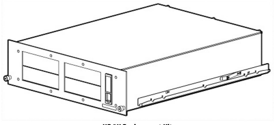
HP 3U Rack-mount Kit

Available in SCSI and SAS interfaces. The 3U Rack-mount Kit holds up to two full-height internal tape drives, four half-height internal tape drives, or a combination of one full-height and two half-height tape drives. This enclosure supports a wide range of tape technologies, including DAT, and Ultrium, with a maximum capacity of 12.5 TB using two LTO-6 Ultrium 6650 or 25 TB with four LTO-6 Ultrium 6250 SAS drives (assuming 2.5:1 data compression).