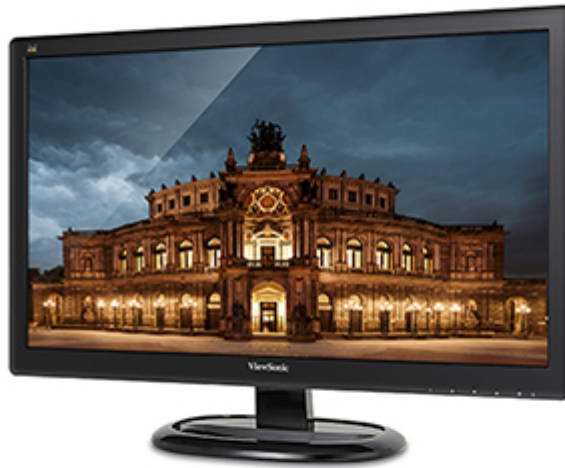
3000:1 Static Contrast Ratio