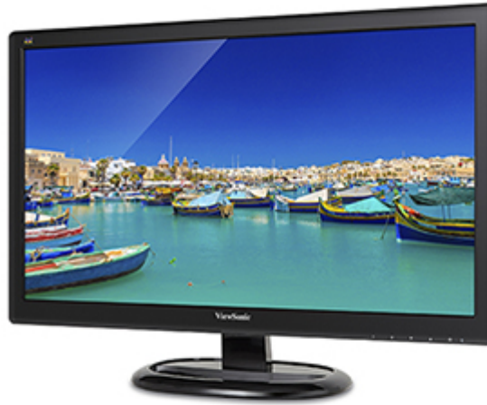
ViewSonic Flicker-Free Technology