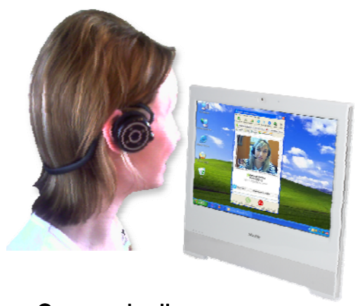
Communication Email, VoIP, Messenger, Blog, Video Conferencing