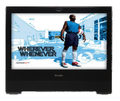
Digital Signage Visual advertising, entertainment, displaying information in public areas