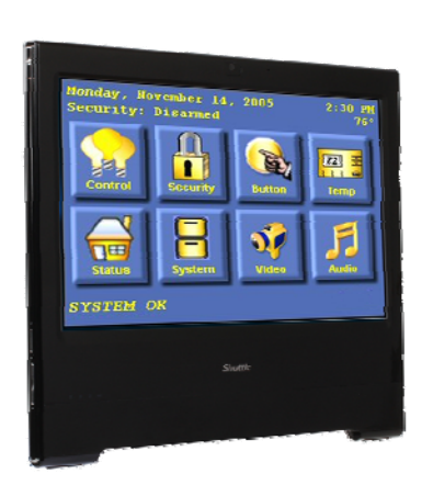
Control Surveillance, Home Automation, Control device