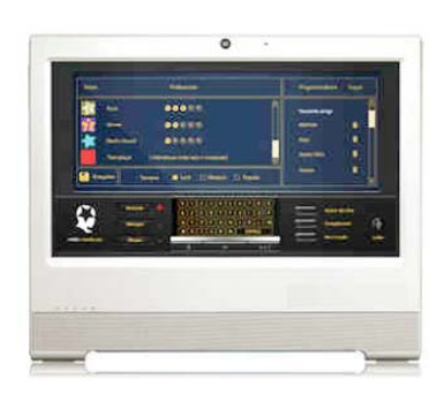
Instore Radio Playing advertising and music