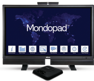
Mondopad via USB

Use Thunder with the InFocus Mondopad for clear, efficient videoconferences in small-to-medium sized rooms, or in larger rooms with the optional Mic Pods. You can also use it with any other PC-based communication software (such as Skype, Lync, Jabber, etc.) to enhance audio quality and comfort. Its Bluetooth connectivity makes it easy to use with mobile devices.