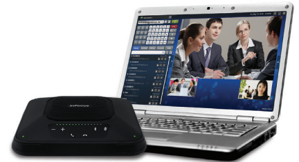
PCs via USB