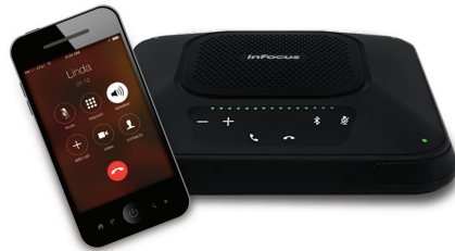
Mobile phone via Bluetooth