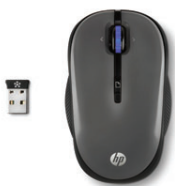
HP X3300 (Gray) Wireless Mouse H4N93AA