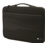
HP 14 Black Stream Notebook Sleeve WU676AA