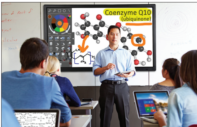
65" JTouch with Wireless Collaboration (INF6501CB/INF6501CBp)