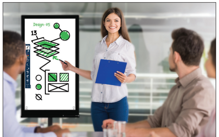
40" DigiEasel (INF4030/INF4030p)