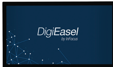
DigiEasel works in either portrait or landscape mode.