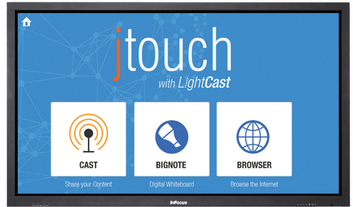
65" JTouch Whiteboard with LightCast (INF6501CB/INF6501CBp)