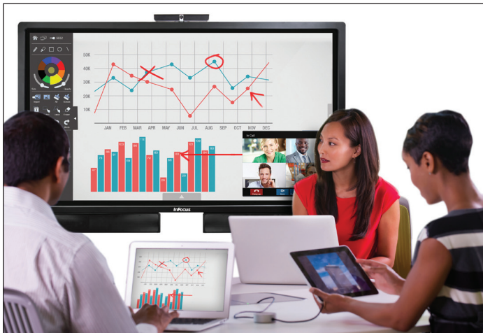
70" Mondopad (INF7021)