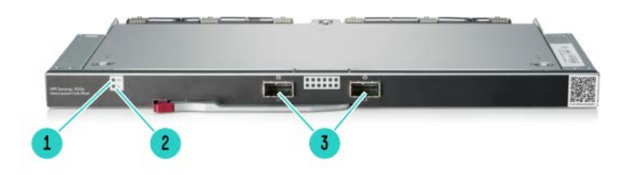
Figure 1 HPE Synergy 20G Interconnect Link Module Bezel

The master module contains intelligent networking capabilities that extend connectivity to frames equipped with satellite modules. This reduces the need for top of rack switches and substantially decreases cost. The reduction in components simplifies fabric management at scale while consuming fewer ports at the data center aggregation layer.