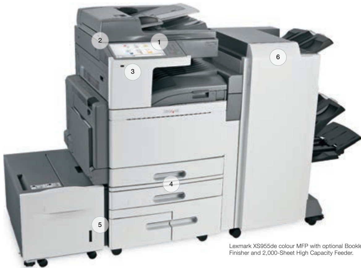
Lexmark XS955de colour MFP with optional Booklet Finisher and 2,000-Sheet High Capacity Feeder.